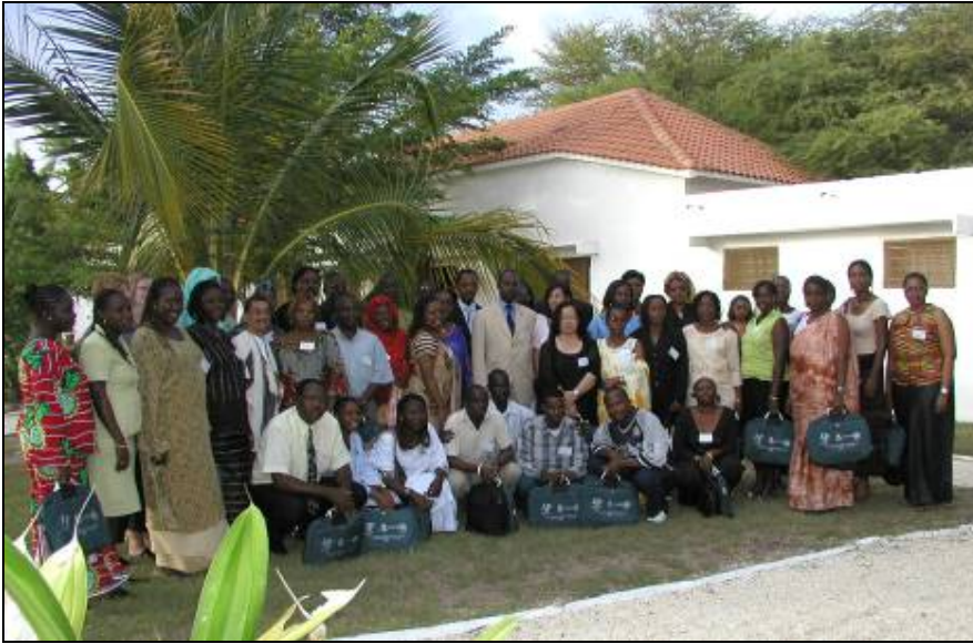
Participants at the Short Course in Mbodiène