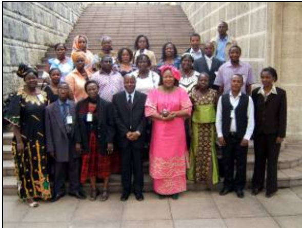
African Union Gender Directorate Meeting

Over the years, FAS has been able to strengthen its partnership with the AU and increase its impact on the development of the AU's gender mainstreaming strategy and policies. 2006 saw increased opportunities for FAS to further implicate itself in the work of the AU Gender Directorate and participate in the design of the AU's gender mainstreaming tools.