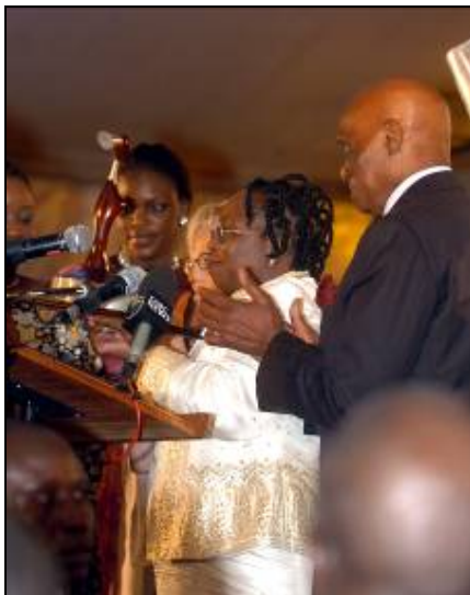
Her Excellency Dr. Nkosazana Dlamini Zuma, Minister of Foreign Affairs of South Africa, accepting the 2005 African Gender Award on behalf of President Mbeki

The first African Gender Award (2005) was awarded to President Wade of Senegal and President Mbeki of South Africa in recognition of their work on gender equality and mainstreaming in the African Union (AU).