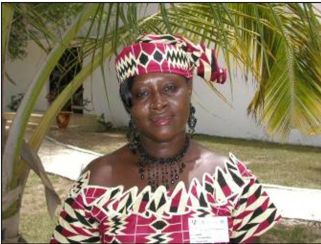
Participant from Sierra Leone.

One representative of each MARWOPNET country attended a short course on Gender and Peacebuilding , organized in July 2006 in Mbodiene, Senegal, by FAS's PanAfrican Centre for Gender, Peace and Development. The short course was a key opportunity for the network members to build their capacities to mainstream their peace and development agendas and network through an online interactive forum that has been designed for follow-up.