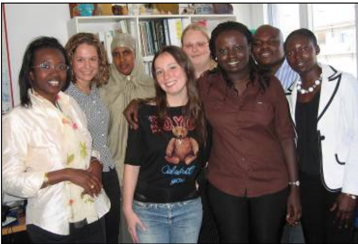
2006 Geneva staff

FAS also conducted numerous team building workshops and trainings sessions to build capacity and reinforce a comprehensive vision of FAS's mission, objective and role of each staff member. Particular meetings focused on building FAS's advocacy capacity to influence policies and programmes on peace building and conflict prevention and its ability to strengthen the capacity of African women for sustainable peace and security. The Dakar Office organized four teambuilding meetings and several staff meetings throughout 2006. In Geneva, the International Secretariat held eight teambuilding meetings and several staff meetings. Other meetings to review the programme, mid-term evaluations, planning sessions and reviews of three month planning sessions were also held.