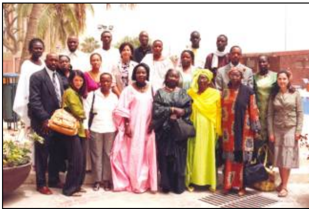
Harmonisation Workshop with UPEACE

FAS and UPEACE organized a seminar in March 2006 in Dakar, Senegal on the harmonization of curriculum in preparation for the workshop of the PAC. Attended by FAS staff and UPEACE professors from Costa Rica , the seminar presented FAS's case studies that emanated from its ten year evaluation study by the external consultants . At the closing of the meeting, it was agreed that both parties would prepare work towards an MA degree programme and work on the short course, during which FAS's case studies would be presented. A road map was drawn showing the various steps to be undertaken.