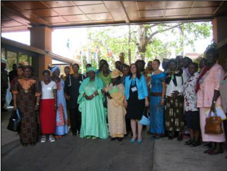
Participants with the vice-president of Gambia

The meeting also saw the organization of a press conference during the AU Summit during which members of the Campaign and FAS members were interviewed.