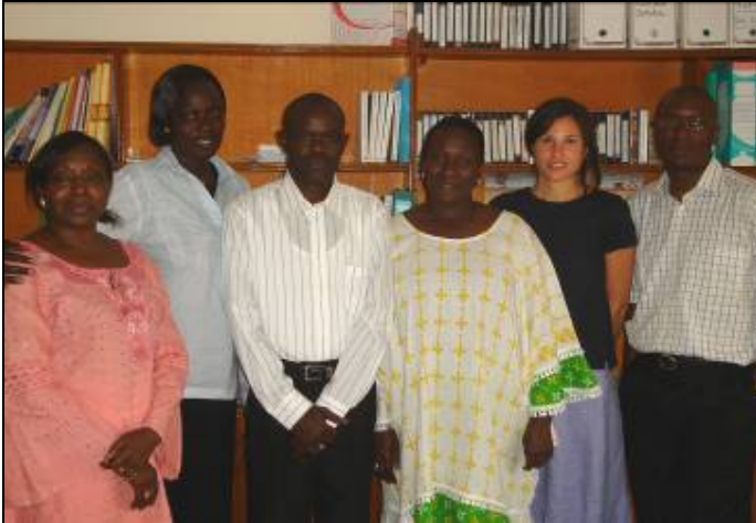
2006 Dakar staff

In 2006, FAS continued to strengthen its capacity in order to effectively coordinate its three offices. The Dakar Office saw its increased institutionalization through the recruitment of permanent staff , and the acquisition of computers and other technical equipment . In 2006, all three Offices were supplied with a computer for each staff member and Skype accounts to ensure daily inter-office communication, coordination and the transfer of knowledge. Inter-Office visits were carried out by FAS staff members.