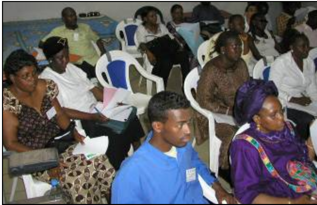
Participants from the Great Lakes & Horn of Africa in field visit

FAS also supported the participation of six representatives of women and human rights groups from the Great Lakes at the training workshop on Gender and Peacebuilding organized by the PanAfrican Centre in July 2006 in Mbodiene, Senegal. Participants coming from the countries of Burundi, Rwanda, and DRC in the Great Lakes took part in the short course that sought to provide training on democratization processes and capacity building.