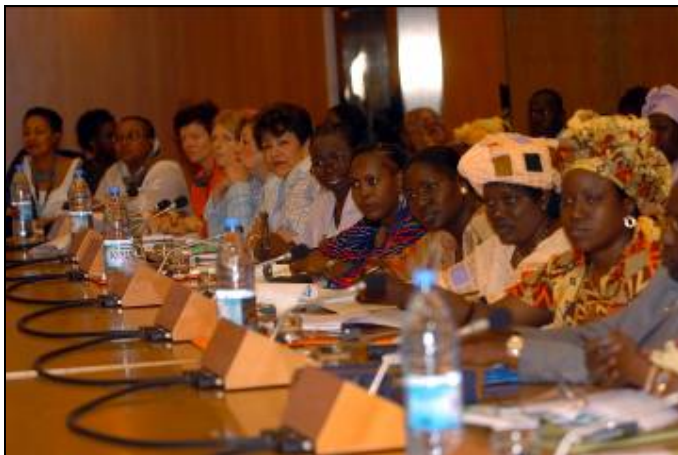
Participants of the African Gender Forum

In April 2006 the report on the African Gender Forum and Award 2005 has been finalized and sent to the participants and to FAS members and its partners.