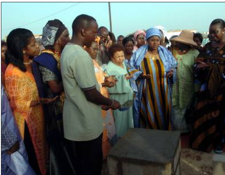
Groundbreaking of the Pan African Center for Gender, Peace and Development

The Centre project was launched during the 1 st edition of the African Gender Forum and Award, that took place in 1-2 May 2005, in Dakar, Senegal.