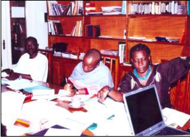
External Evaluators in FAS Regional Office

FAS's programme is also systematically monitored through the following techniques: