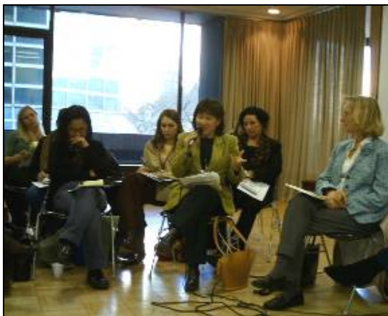
FAS Round-table on Peacebuilding commission